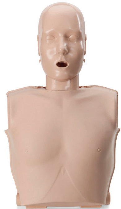
ITEM # PP-ULM-400-MS (Prestan Ultralite Manikins)