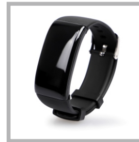
Compression Rate and Depth Monitor