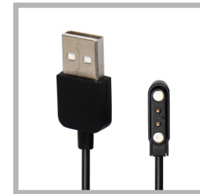
Magnetic USB charging cable