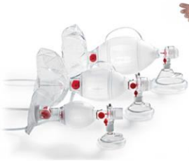
Ambu ® BVMs