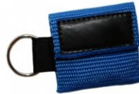
CPR Barriers in many sizes and styles