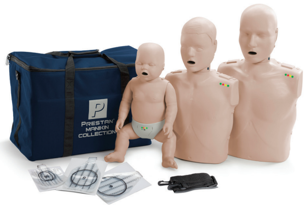
The Prestan Collection (1 Adult / 1 Child / 1 Infant) Comes with 10 Face-Shield/Lung-Bags per Manikin

Prestan Manikins are available in 2 convenient multi-packs.