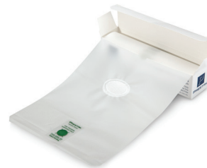
Prestan Professional Generic Face Shield Adult 36-Count 10077-PPS

Accessories are considered consumable items meant for a single use and are not covered by Prestan's three (3) year product warranty.