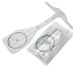
Prestan Professional Face-Shield Lung Bags Adult 50-Pack: PP-ALB-50 Adult 10-Pack: PP-ALB-10 Also available for Child, Infant and Ultralite Manikins

Plan ahead to be sure you have enough Prestan accessories for your training needs. Prestan Accessories are available from your Prestan Authorized Distributor.