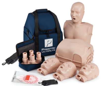
Prestan Ultralite Manikins ITEM # PP-ULM-400-MS