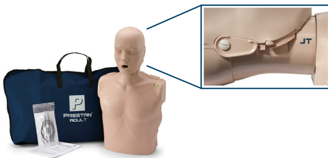
Prestan Professional Adult Jaw Thrust CPR-AED Training Manikin

Prestan's Jaw Thrust Head gives instructors the option to teach with the jaw thrust maneuver or head-tilt/chin-lift.