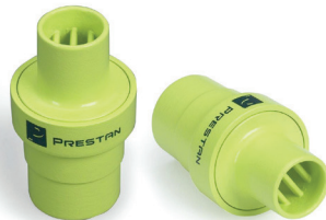
Prestan Professional Rescue Mask Adaptors (10-Bag) 10076-PPA