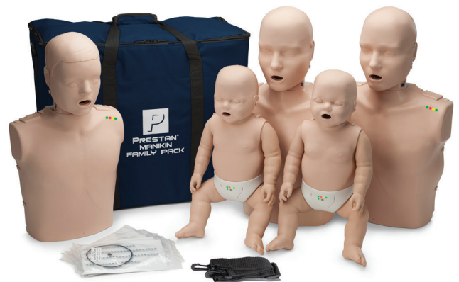
The Prestan Family Pack (2 Adults / 1 Child / 2 Infants) Comes with 10 Face-Shield/Lung-Bags per Manikin